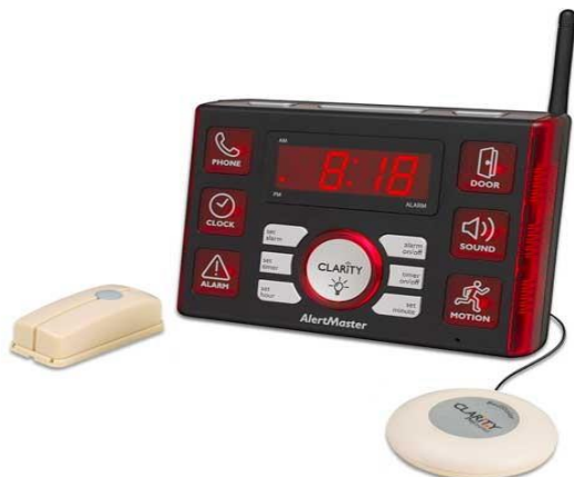
AL 10 (Base unit)

Please note that only phone, doorbell and alarm clock functions are included with Alertmaster system. Additional accessories sold separately.